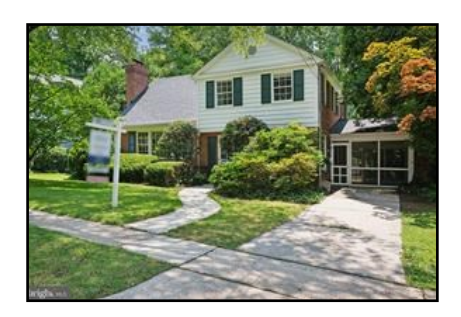
5804 Ridgefield Rd. Pending Settlement Listed at $1,390,000

Somedays, a Realtor is sitting around thinking "what am I going to work on today" when the phone rings and suddenly you go from zero to 60 in a heartbeat. The owners of 5709 Cromwell bought the house in 2009 for $650,000. They wanted their son to attend Whitman. They did many fine improvements to the home over the years. Their son, still living in the house, was "launching" to a job in North Carolina and it was time to sell the house as the parents had bought a larger home in Germantown. I swung into action to get several important improvements made. The 5-level split came on the market in April, and within days we had four offers. Listed at $1,499,000, it sold for $1,641,904 , almost 143K over the price.